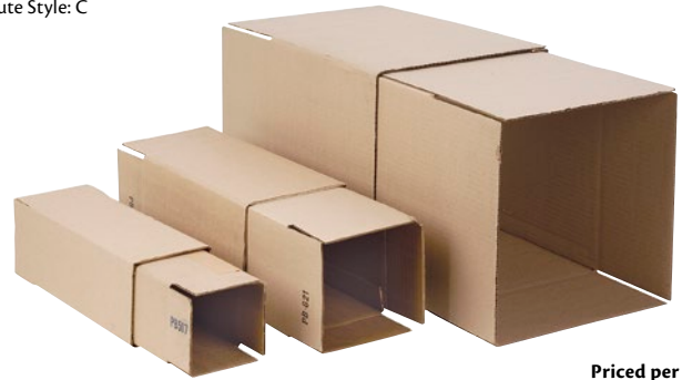
Priced per Box