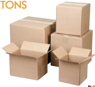
Priced per Box